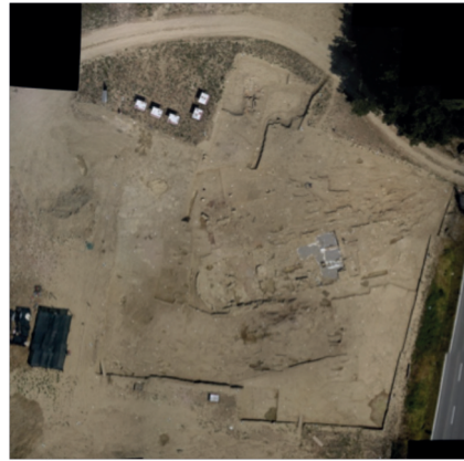
Fig.1: The site.

The image block was processed with the TAPEnADE tools in ca 3 hours, producing a point cloud of approximately 60 million points.